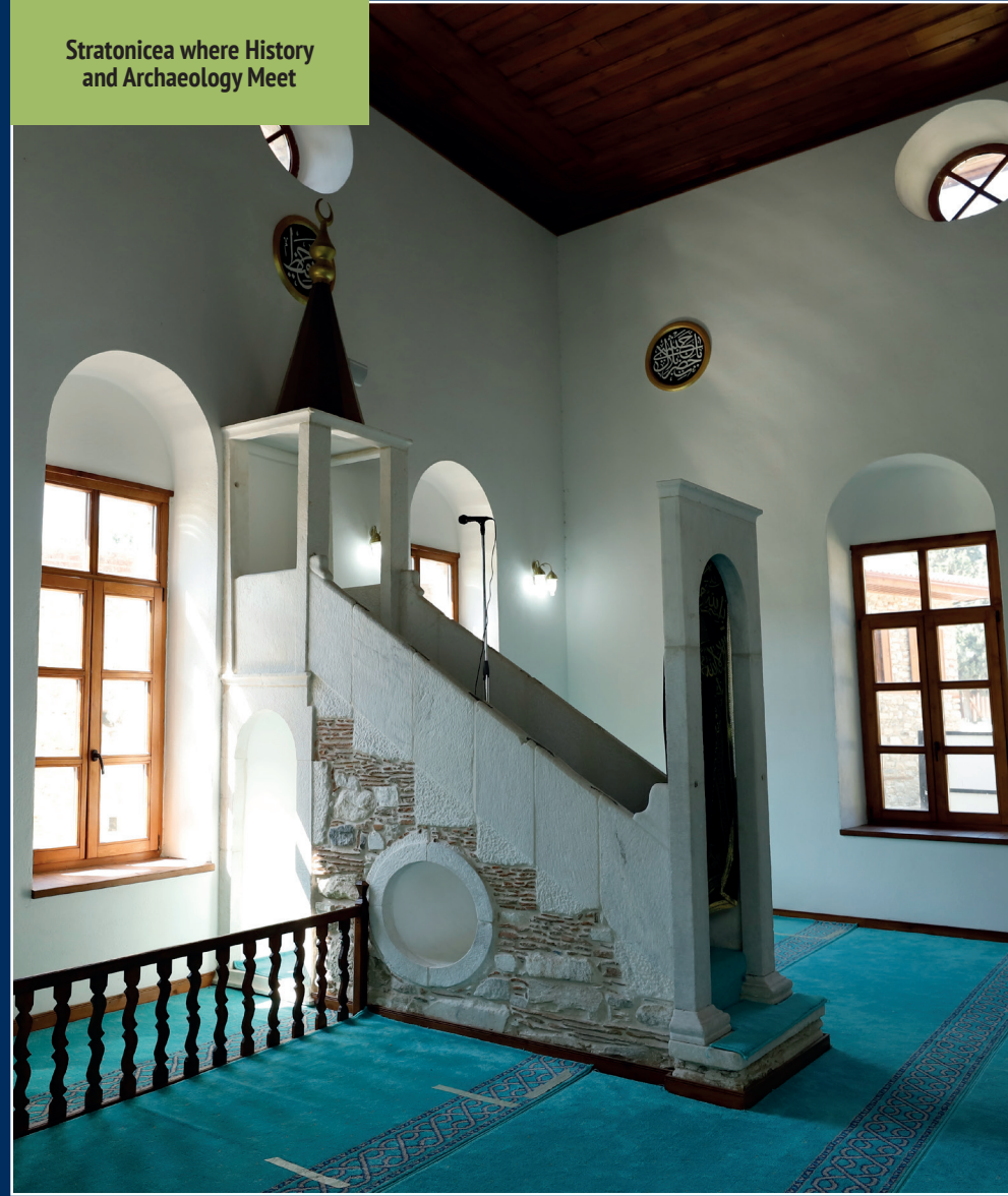
Stratonicea where History and Archaeology Meet

It is one of the rare places where Antique and Ottoman and Republican Period building and urban texture can be seen together. The fact that many buildings of different periods are intertwined is a unique opportunity for visitors to the city. All the buildings in the ancient city can be visited by walking on the stone paved roads of Ottoman Period.