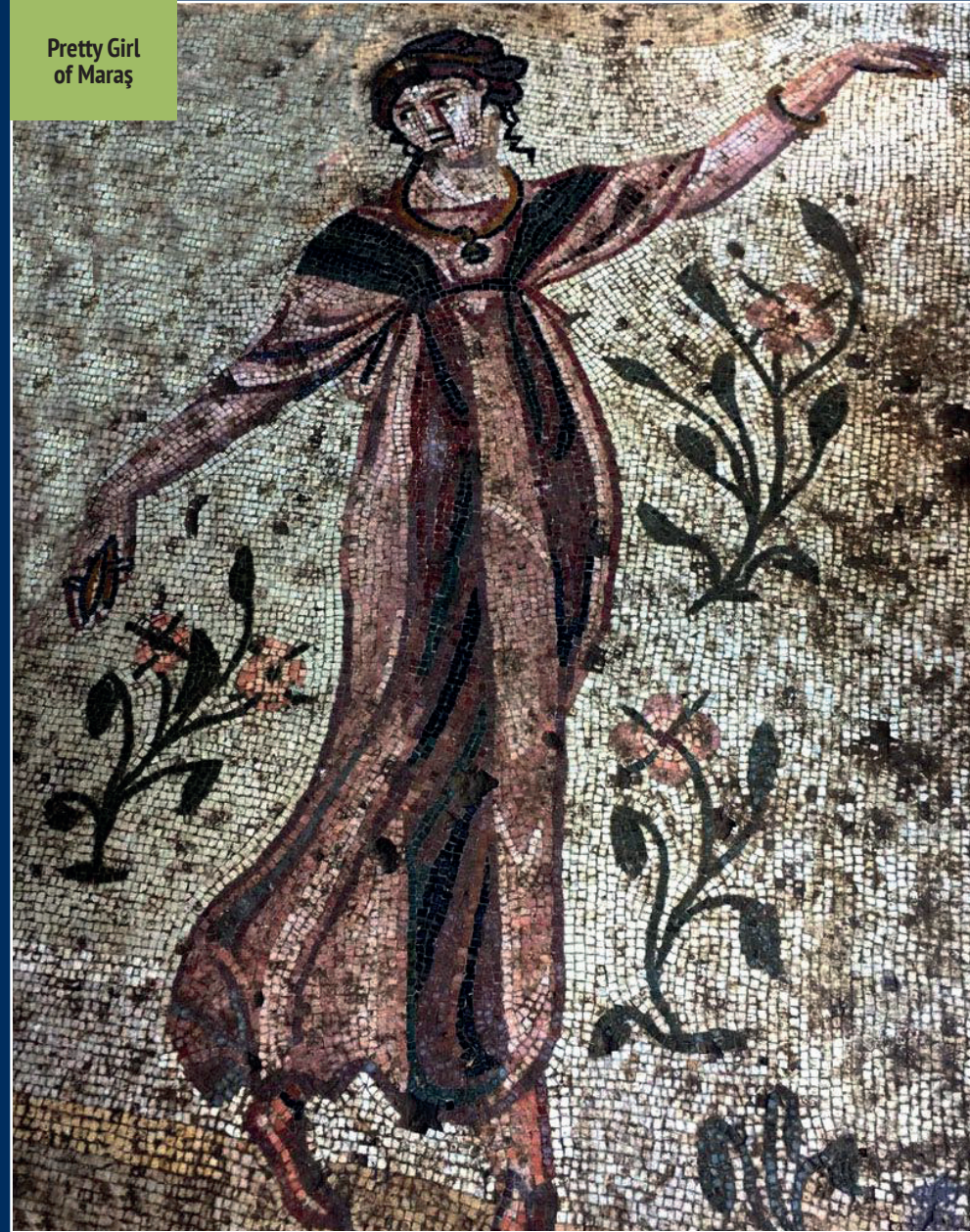
Pretty Girl of Maraş

The name Germanicia, which is only found in Ancient Sources, is now included in scientific sources. After the archaeological excavations carried out since 2007, Germanicia has acquired the identity of Ancient Province instead of Region title.