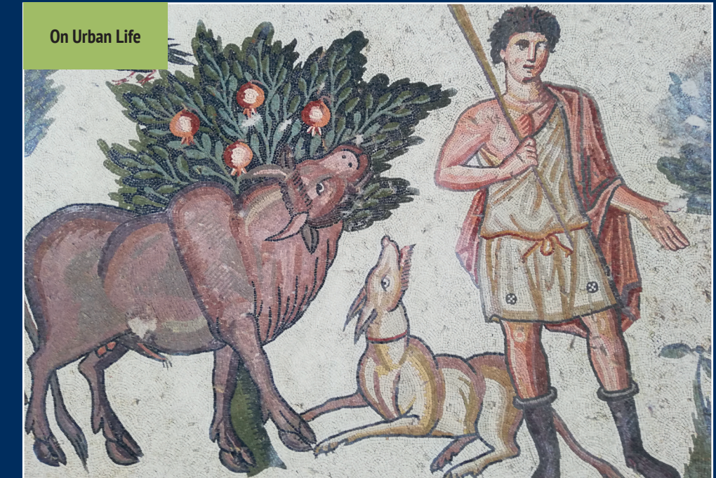
On Urban Life

Germanicia Floor Mosaics, which are mostly about daily life, reflect the lifestyle, religious belief, social and political structure, economic level of the period, as well as provide us with information about the fauna and flora of the region.