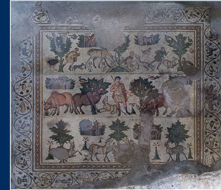
Mystery of the Secret

As a result of the excavations, the veil of mystery of the city is being lifted day by day, and it seems that Germanicia will leave its title of lost city behind and regain its title of Imperial Province as the mystery of the secret unveils in time.